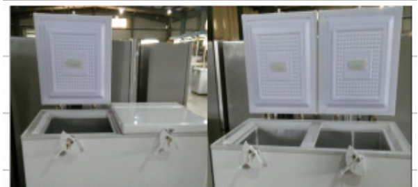
Dual Top Lids with LED lighting